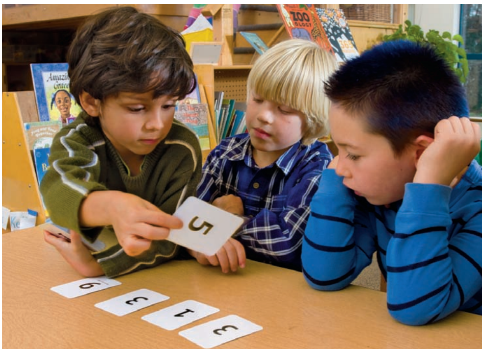
Playing Seven Up: Having students play together in small groups encourages communication while they learn about the numbers that add to 10.

It is essential for students to develop fluency with combinations of 10. Seven Up, a game from Scholastic's Do The Math intervention program, gives students the practice they need. A deck of 40 cards is required—four each of cards numbered 1 to 10. (A deck of playing cards with the face cards removed works well.) To play, students deal seven cards face up in a row. They remove all 10s, either individual cards with 10 on them or pairs of cards that add to 10. Each time players remove cards, they