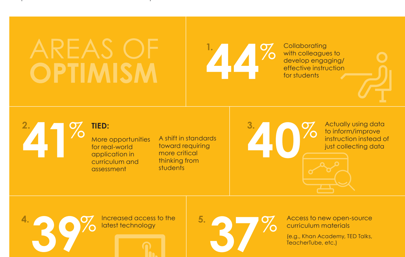
Top 5 Points Of Educator Optimism

The independent survey was conducted by the market research agency MDR on behalf of HMH® and included educators with a wide range of experience in the field (from less than one year to more than 20 years). It was answered by roughly equal numbers of teachers from the K–2, 3–5, 6–8, and high school levels (325, 357, 328, 372, respectively). Math, science, social studies, English language arts and literacy, and general classroom teachers were represented in approximately equal numbers. Of teachers surveyed, 30% had from less than one year to 10 years of experience; 33% had between 11 and 20 years of experience; 37% had 20 or more years of experience.