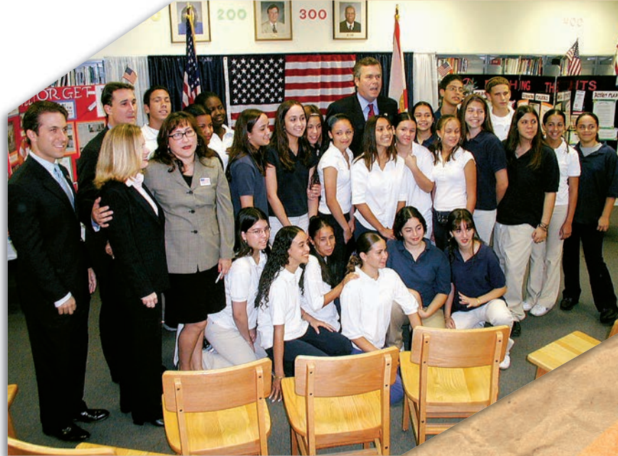
Students in a Project Citizen class in Hialeah, Florida, pose with Florida governor Jeb Bush.