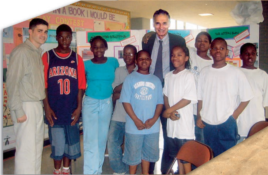
Ralph Nader visits with students at the Byrd Community Academy in Chicago.

Taking Action The students wanted the school board to fulfill its promise. They researched and developed an 11-point action plan for achieving their goal. To generate public support, they took pictures of the building, produced a documentary video showing its problems, and wrote to government officials. The vice president of the United States, a U.S. senator, a U.S. representative, and an independent presidential candidate all expressed support for the plan. Donations poured in from private citizens. However, the school had low enrollment, and district resources were scarce. The school board made an economic choice to use the money it would cost to rebuild the school for other uses benefiting more students. Byrd Academy closed, and its students were moved to another school. Although the students did not achieve their goal, they attracted national attention to the issue of how a school's physical environment can affect student learning.