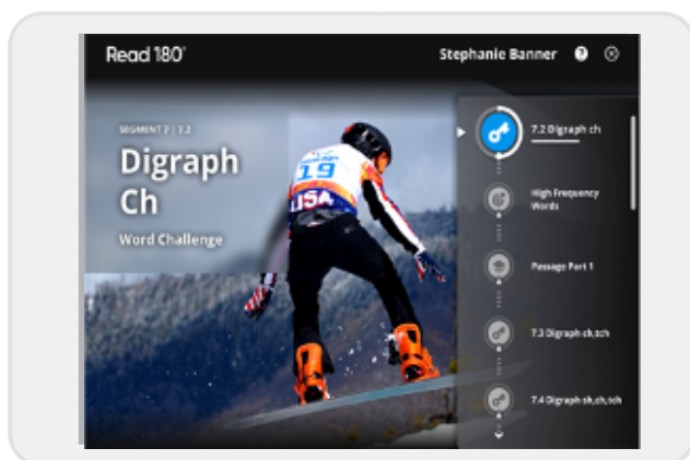
Discover Read 180

Read 180 is configured to support all learners—from phonics to fluency to grade-level proficiency.